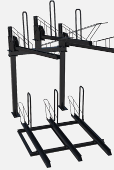
EZ-Lift™ High Density Angled Transversal