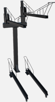
EZ-Lift™ High Density Swivel